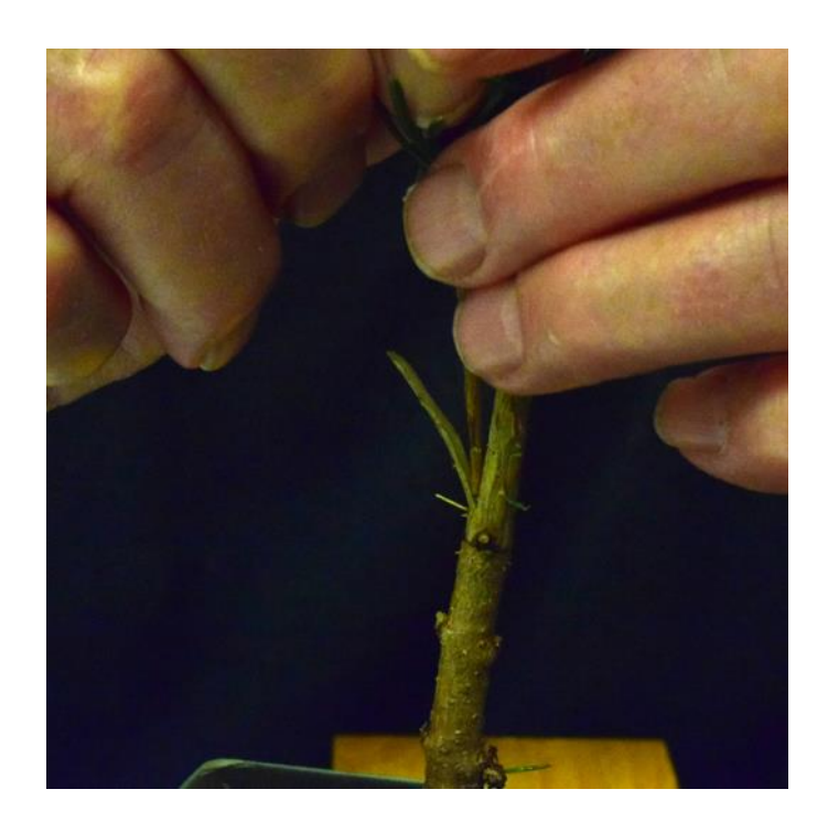
Step 4: Insert Scion into the cleft in the rootstock.