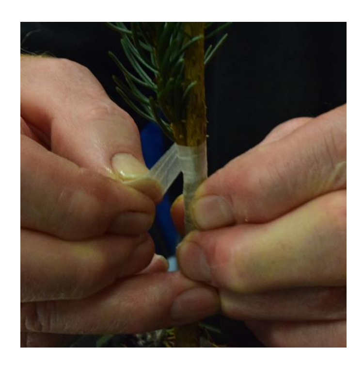
Step 6: Secure tightly with plant tape