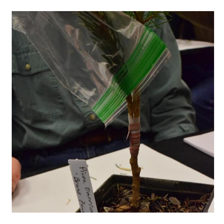
Step 8: Cover with zip-lock bag and label the plant