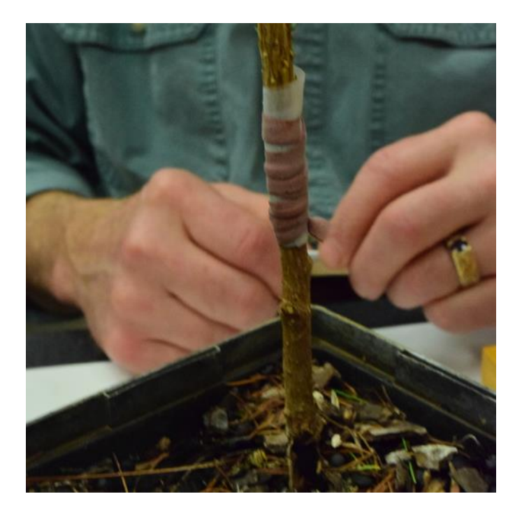
Step 7: Cover tape with rubber band