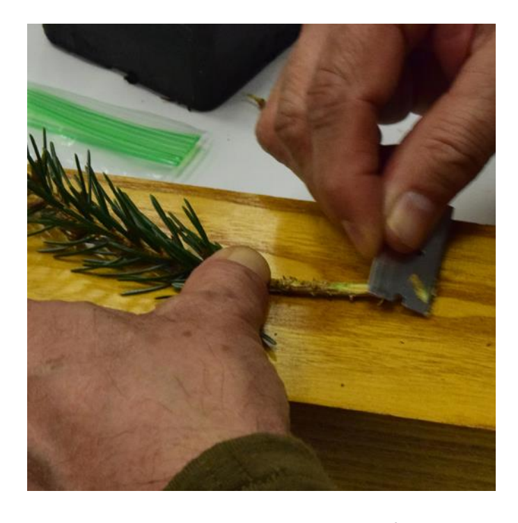
Step 2: Create a wedge shape at the end of the scion.