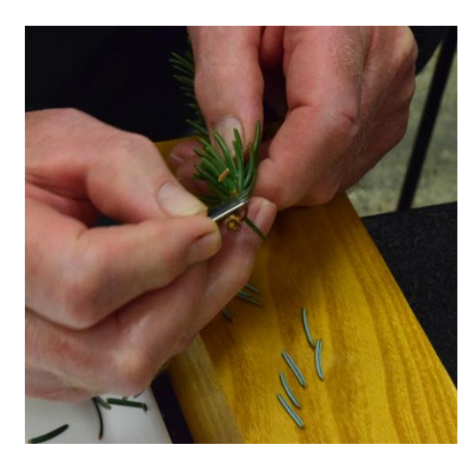
Step 1: Cut off the end and clear the lower 1" to 1-1/2" of needles.

More from a Workshop presented by Jon Genereaux at the February 2017 Meeting