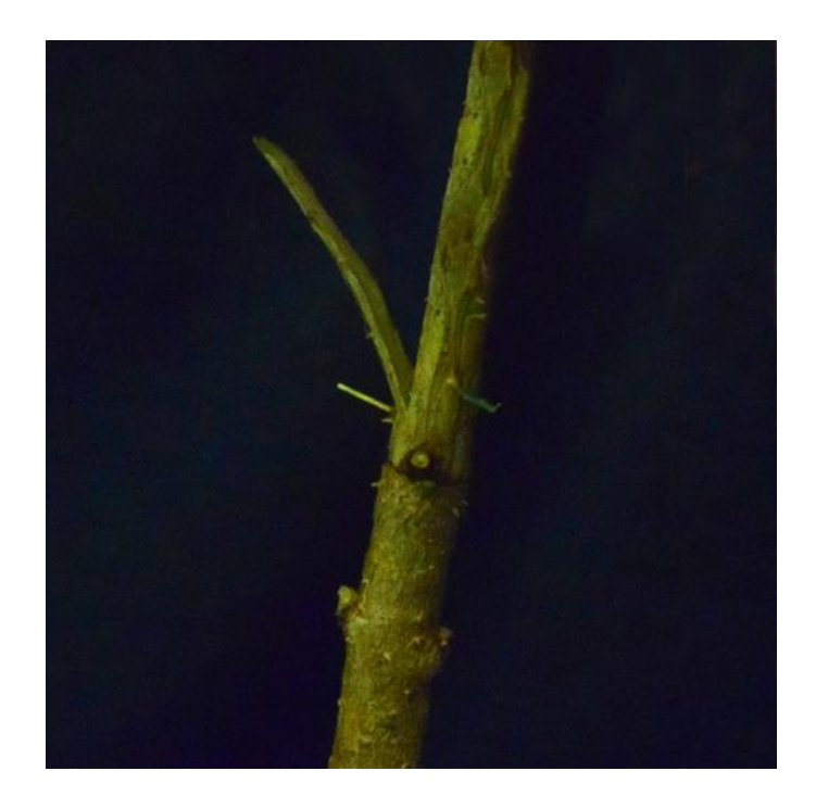
Step 3: Open a cleft in the rootstock exposing the cambium.